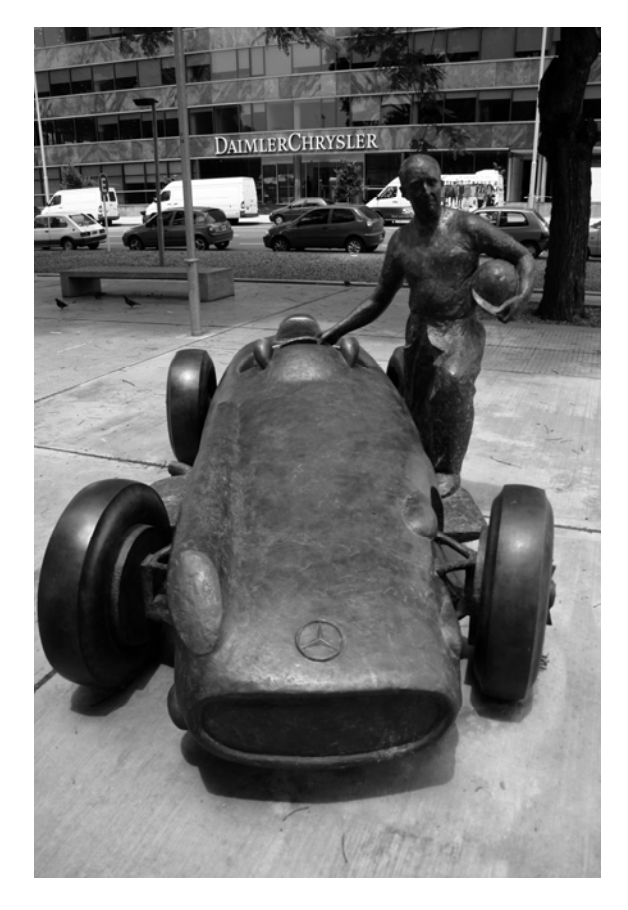
Fig. 4. A bronze sculpture of Fangio, an Argentine racing hero, shown in front of Daimler-Chysler's headquarters in Puerto Madero

racecar (Fig. 4). This example is 'glocal' in that the racecar driver is Juan-Manuel Fangio, a well known icon to Argentineans that won five world racing titles early in the last century. One of those titles was won in a car sponsored by Mercedes-Benz. The statues of the car and Fangio are located along one of the primary boulevards of Puerto Madero and are oriented towards the doors of a neighboring office building which houses the DaimlerChrysler headquarters of Argentina. DaimlerChrysler is the company that currently owns Mercedes. A local hero, therefore, made famous by his global achievements is linked to the national branch of a transnational The local and global infused corporation. through a single narrative in the creation of meaning.