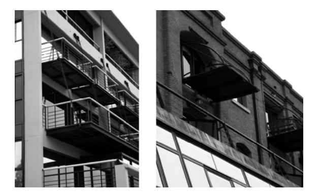
Fig. 2. A critical regionalist approach through tectonics and massing seen in both the adaptive reuse of wharf buildings and adjacent new construction.

This approach caters to architects and relies heavily on the visual aspects of the built realm. To engage or apply critical regionalism requires principally the act of looking at a place without necessarily understanding a culture beyond visual aspects. Form is seen as a container and representation of culture which can be understood and manipulated: formal hybridization ostensibly precipitating cultural hybridization. While limited, this approach can be very powerful in that the visual language is often legible to all who experience an area and does not rely on a deep cultural or historical familiarity with a place.