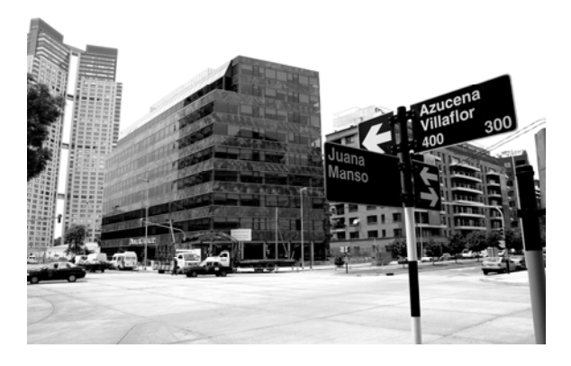
Fig. 5. Streets and parks in Puerto Madero are named after internationally famous Argentine women, adding a mixed global and local narrative to the identity of place.

By naming streets, plazas, and parks after such women, the area constantly references local identities. While some might argue that naming seems a shallow addition to the identity of a place, it is helpful to imagine an alternative condition for Puerto Madero where the streets are named after transnational corporations (IBM Boulevard or AT&T Way) or named after famous international individuals (Milton Friedman Street or Louis Pasteur Lane). Both examples foster an identity which is divorced from the locale and devoid of local meaning. Referencing mixed local and global narratives through the act of naming contributes to the hybrid identity of place.